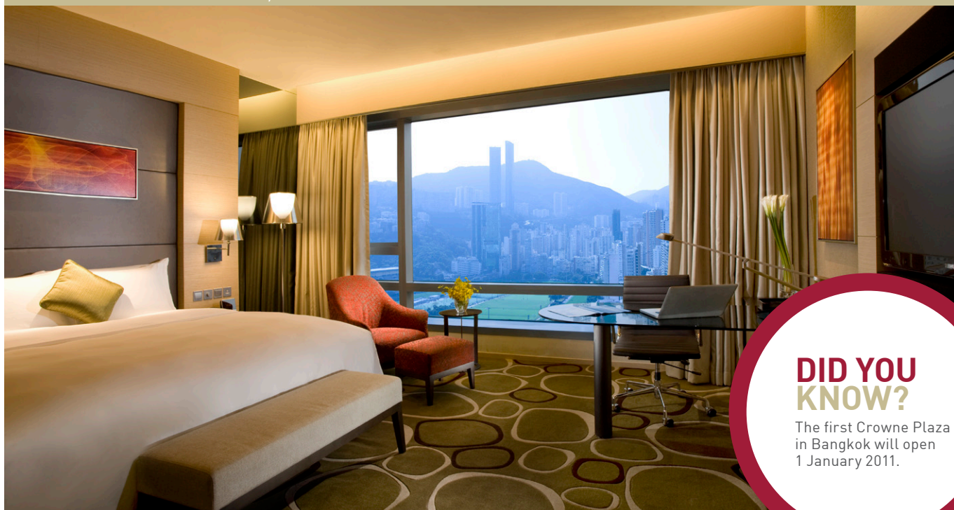
CROWNE PLAZA HONG KONG CAUSEWAY BAY, CHINA

We've invested half a billion dollars to renovate the portfolio in the Americas offering even greater value to travellers.