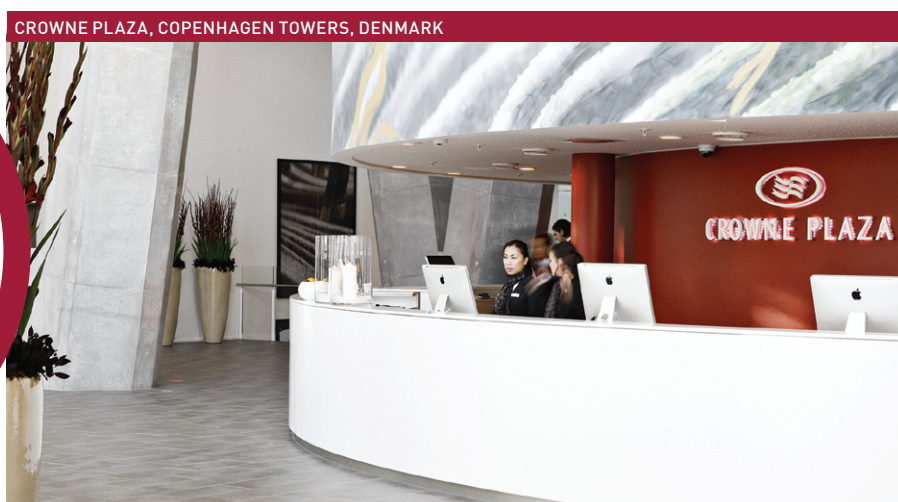
CROWNE PLAZA, COPENHAGEN TOWERS, DENMARK

DID YOU KNOW? Business Travel News magazine announced Crowne Plaza as the No.1 upscale brand as voted by travel buyers in its annual US Hotel Chain Survey (up from 9th in 2009).